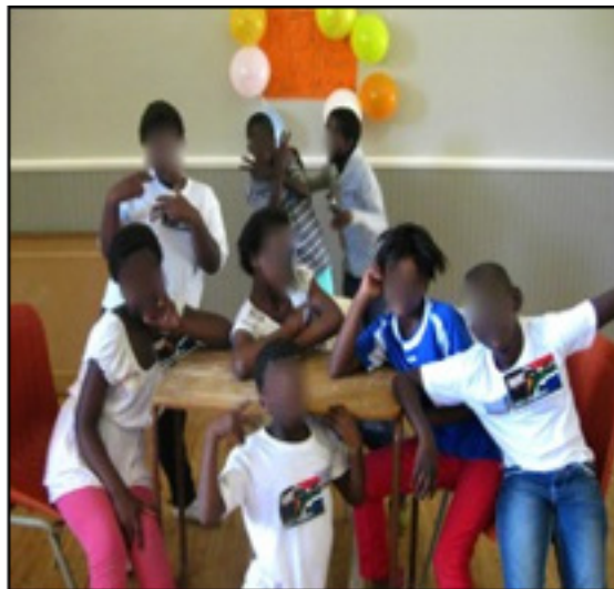
Figures 2 and 3: A cabinet of youth health advisors deliberates on the objectives of the AYHP (2014). Here, the appointed minister consults her cabinet on their experiences of health services. [Faces blurred to protect participant confidentiality]